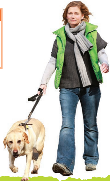
Map: Michael Petterson

Pine trail 3 miles (there & back) A long linear walk, mostly through woodland with circular walks along the route. Dogs are allowed off the lead all year round