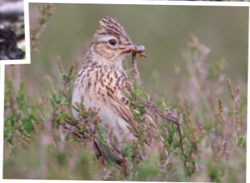
Keeping your dog off the open heath during nesting season will allow nightjars to breed and young skylarks to fledge