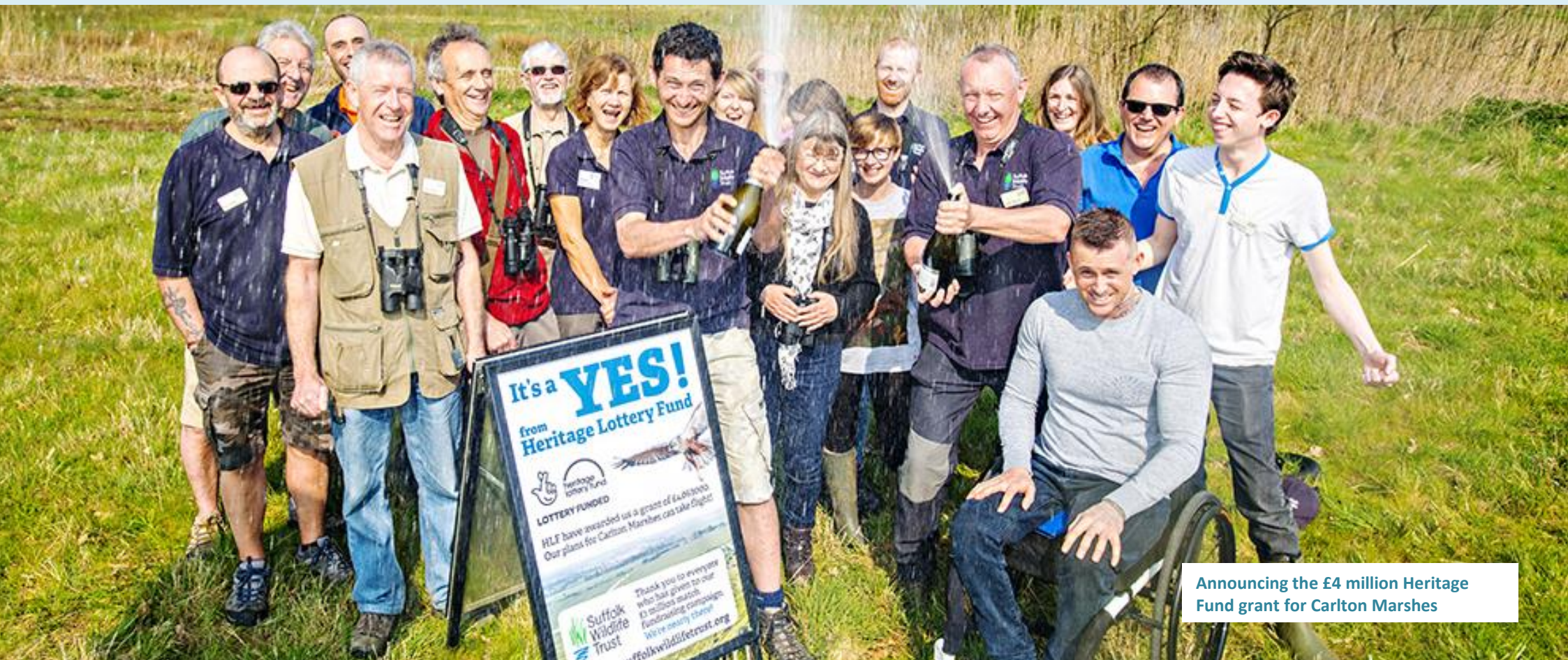
Announcing the £4 million Heritage Fund grant for Carlton Marshes