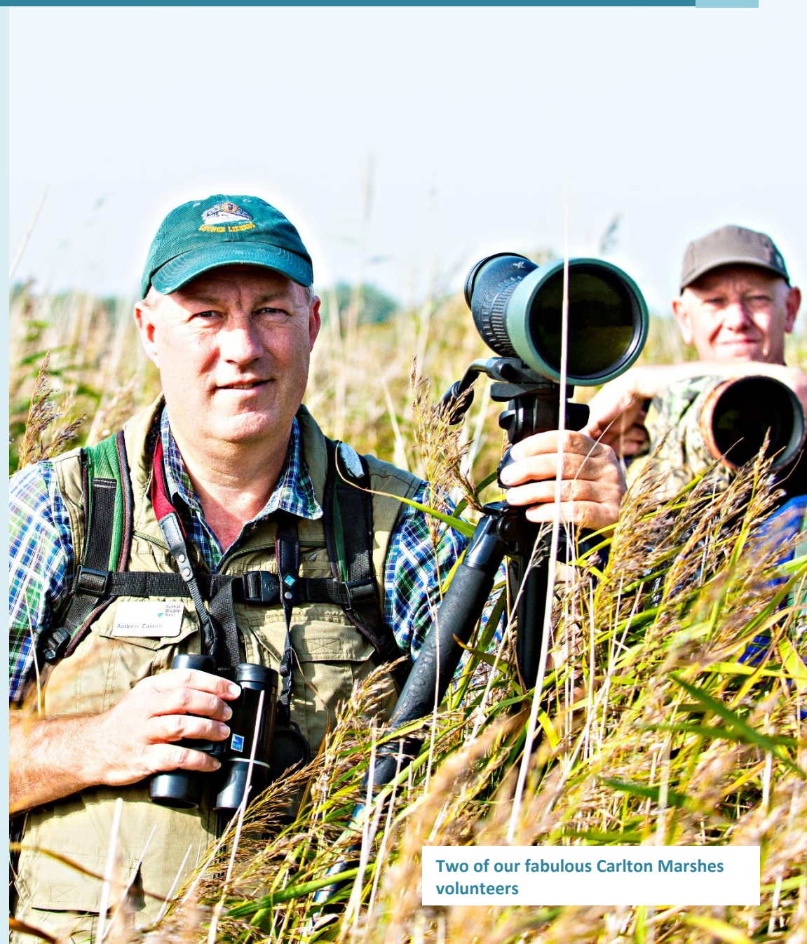
Two of our fabulous Carlton Marshes volunteers