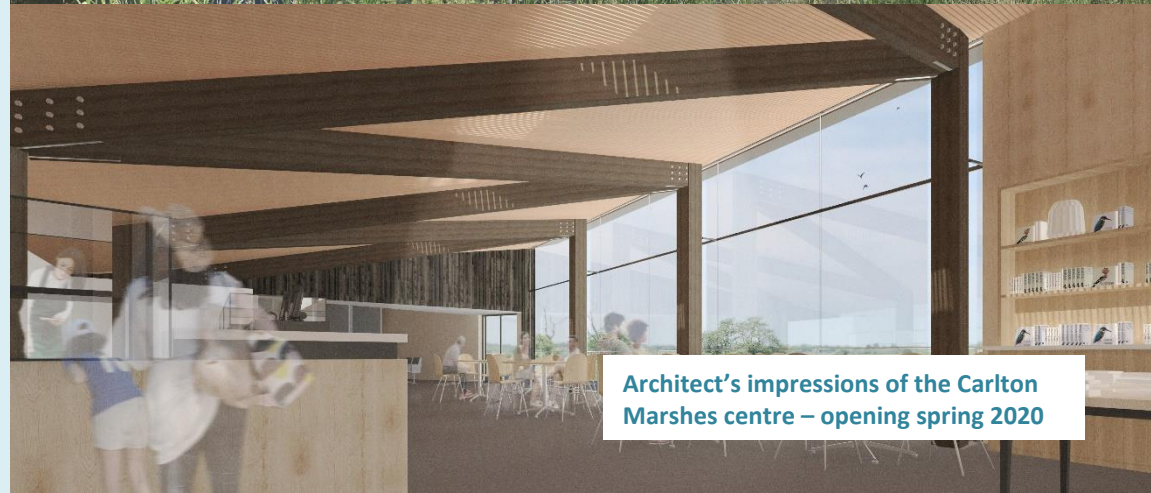
Architect's impressions of the Carlton Marshes centre – opening spring 2020