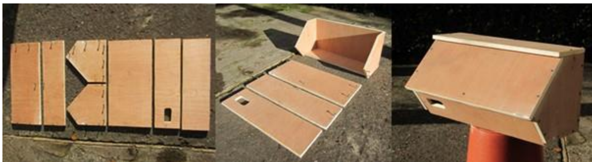
Zeist size small swift box construction