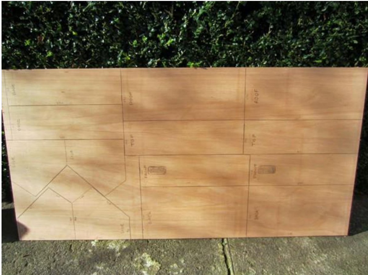
Swift box template

You'll also need per box – 2 x 50mm brackets, a handful of 25mm galvanised nails, 3 x 25mm screws and some adhesive. Use the adhesive on each section before nailing them together to give it more strength. For the top section use screws, so the box can be accessed. All these materials cost under £20, making each less than £10 per box. Paint or stain the nest box to suit your location.